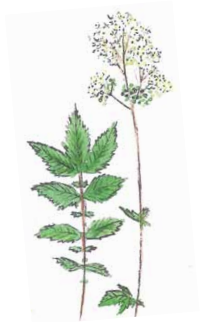
Meadowsweet ( Filipendula ulmaria )

Pick a meadowsweet flower or a leaf. Crush the plant between your fingers so fluid will trickle out. Can you feel the aromatic scent? Aspirin was initially created from salicin, derived in 1839 from meadowsweet.