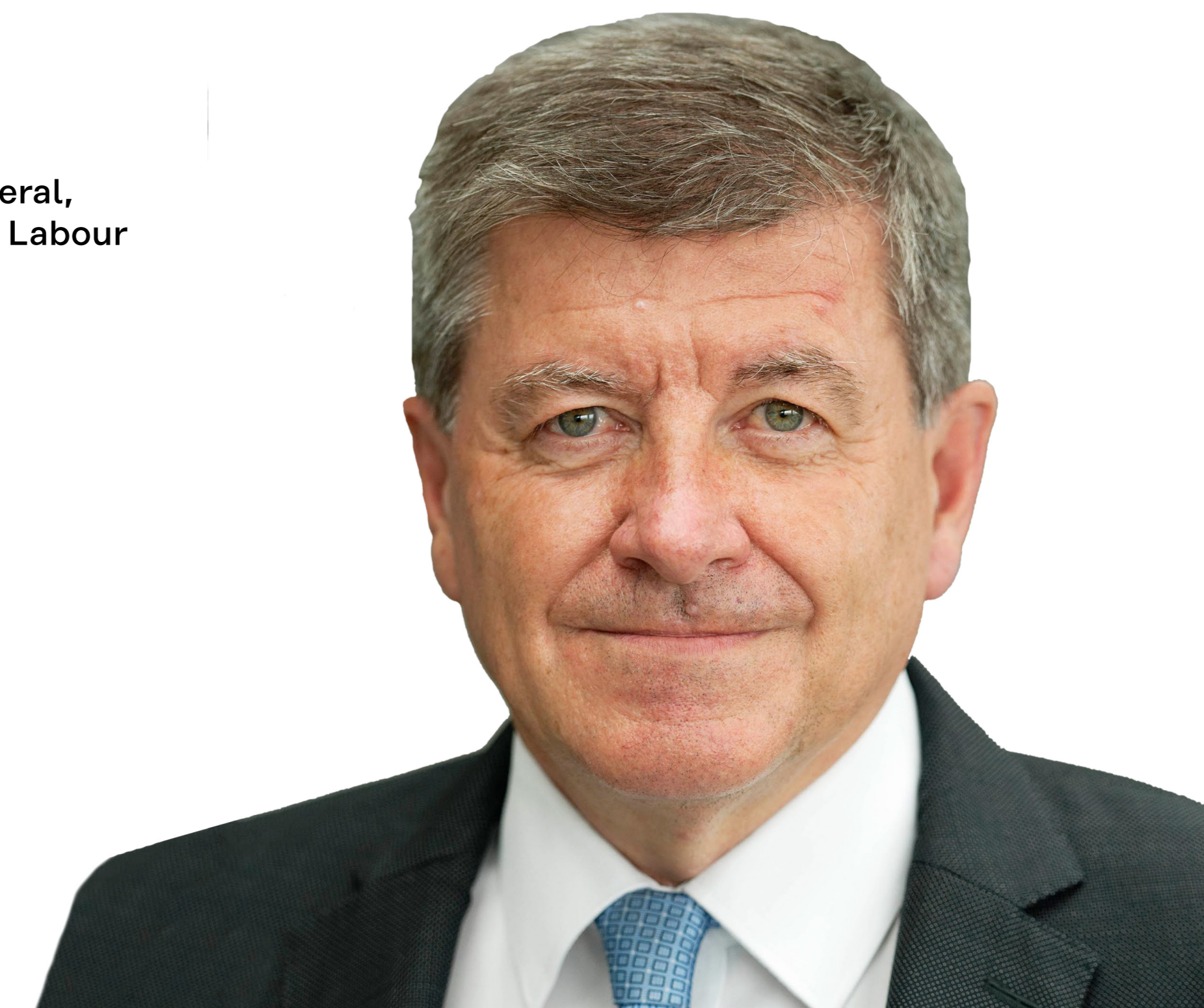
GUY RYDER Director-General, International Labour Organization

"With so many millions of jobs at stake, the transition towards the circular economy needs to be a just transition – based on social justice and decent work for all. To ensure that social and environmental progress go hand in hand, we must start valuing properly the people that make the circular economy work."